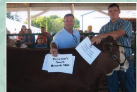
Peterson's Country Mill has always supported local youth in 4-H.